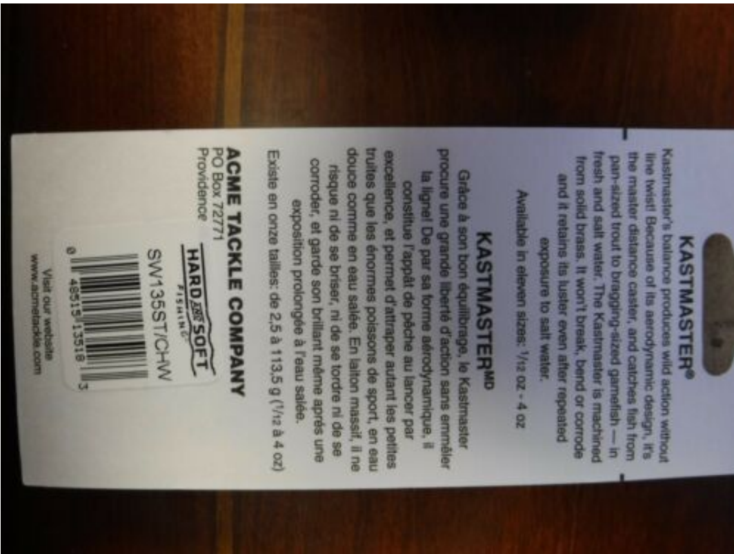
A Half Dozen After A Half Distance